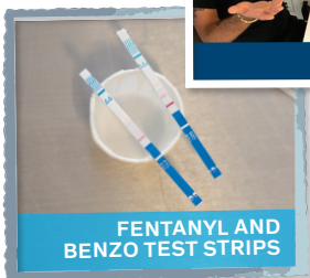
FENTANYL AND BENZO TEST STRIPS