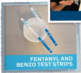
FENTANYL AND BENZO TEST STRIPS